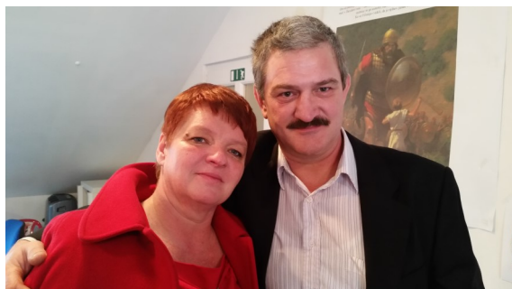
This man received the Lord, was healed, delivered from alcoholism, filled with the Spirit and spoke in tongues. He came to the Healing School and testified that he was a changed man!