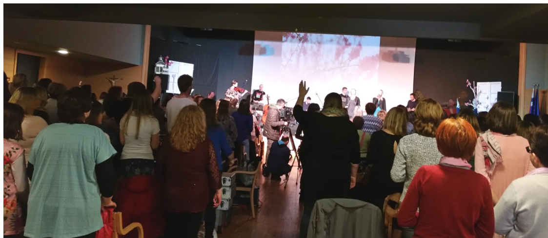
The 15th annual women's conference in Ljubljana, Slovenia was impressive.