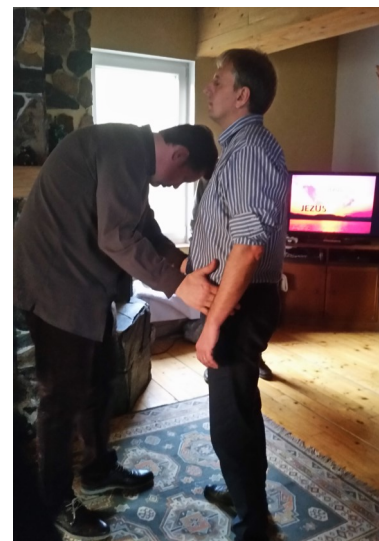
This man received healing of his hips.